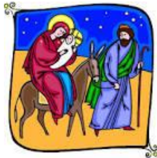
Peace on Earth